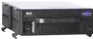
Avid MediaDrive rS 320/LVD