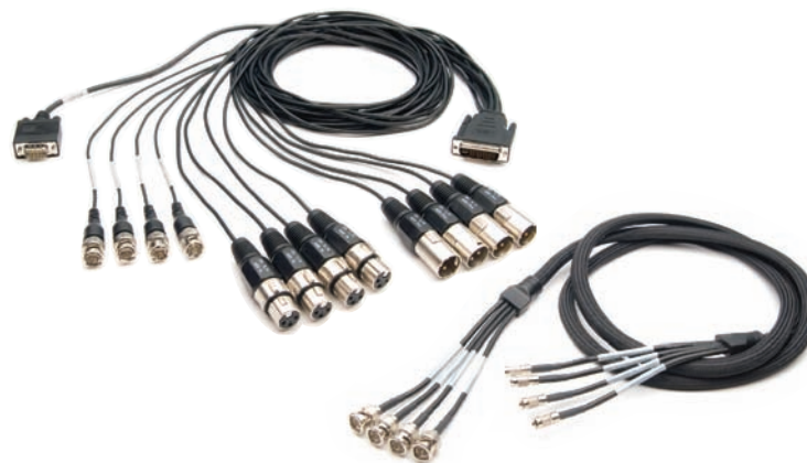
KONA 3 Breakout Cables

Since 1993, AJA Video has been a leading manufacturer of high-quality and cost-effective digital video interface, conversion and Desktop solutions supporting the professional broadcast and post-production markets. With headquarters in Grass Valley, California, AJA maintains an extensive sales channel of dealers and systems integrators around the world. For further information, please see our website www.aja.com .